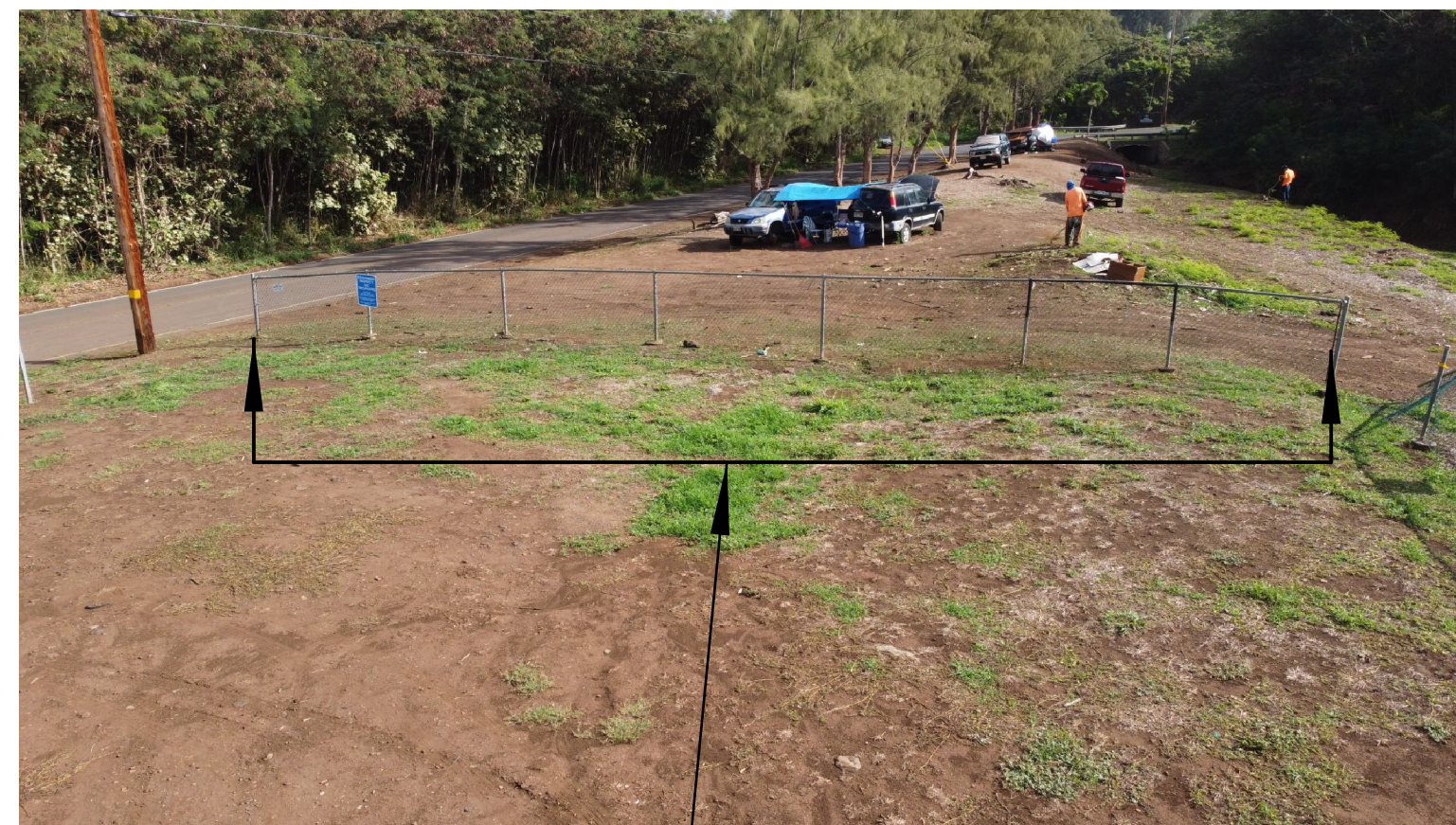
REPLACE 7 PANEL FABRIC (APPROXIMATELY 56 LF)