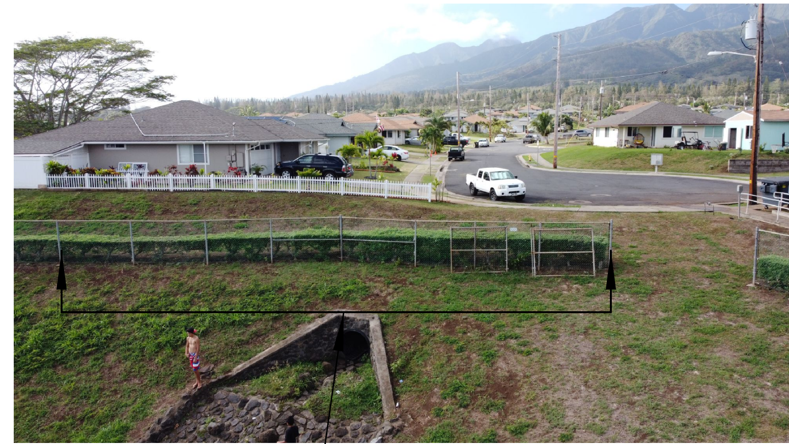
REPLACE 8 PANELS FABRIC (APPROXIMATELY 80 LF)