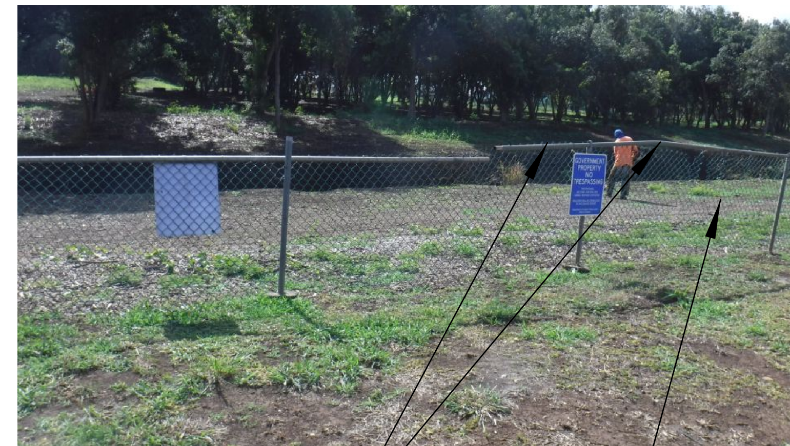
REPLACE 2 PANELS TOP RAIL (APPROXIMATELY 20')