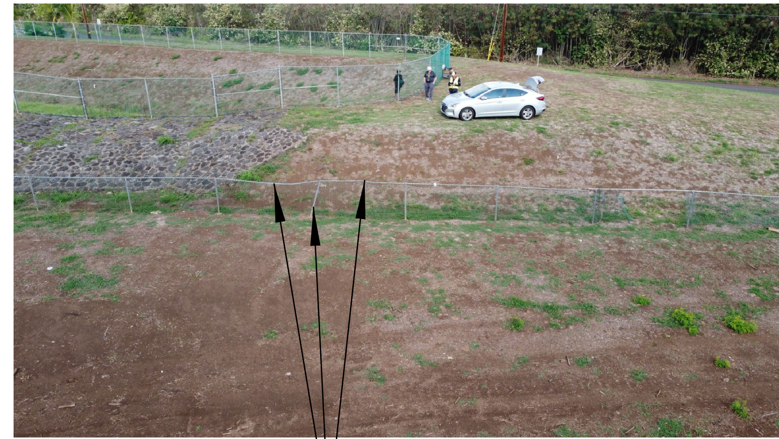
REPLACE 2 PANELS TOP RAIL 1 POST 4' HIGH (APPROXIMATELY 20 LF)