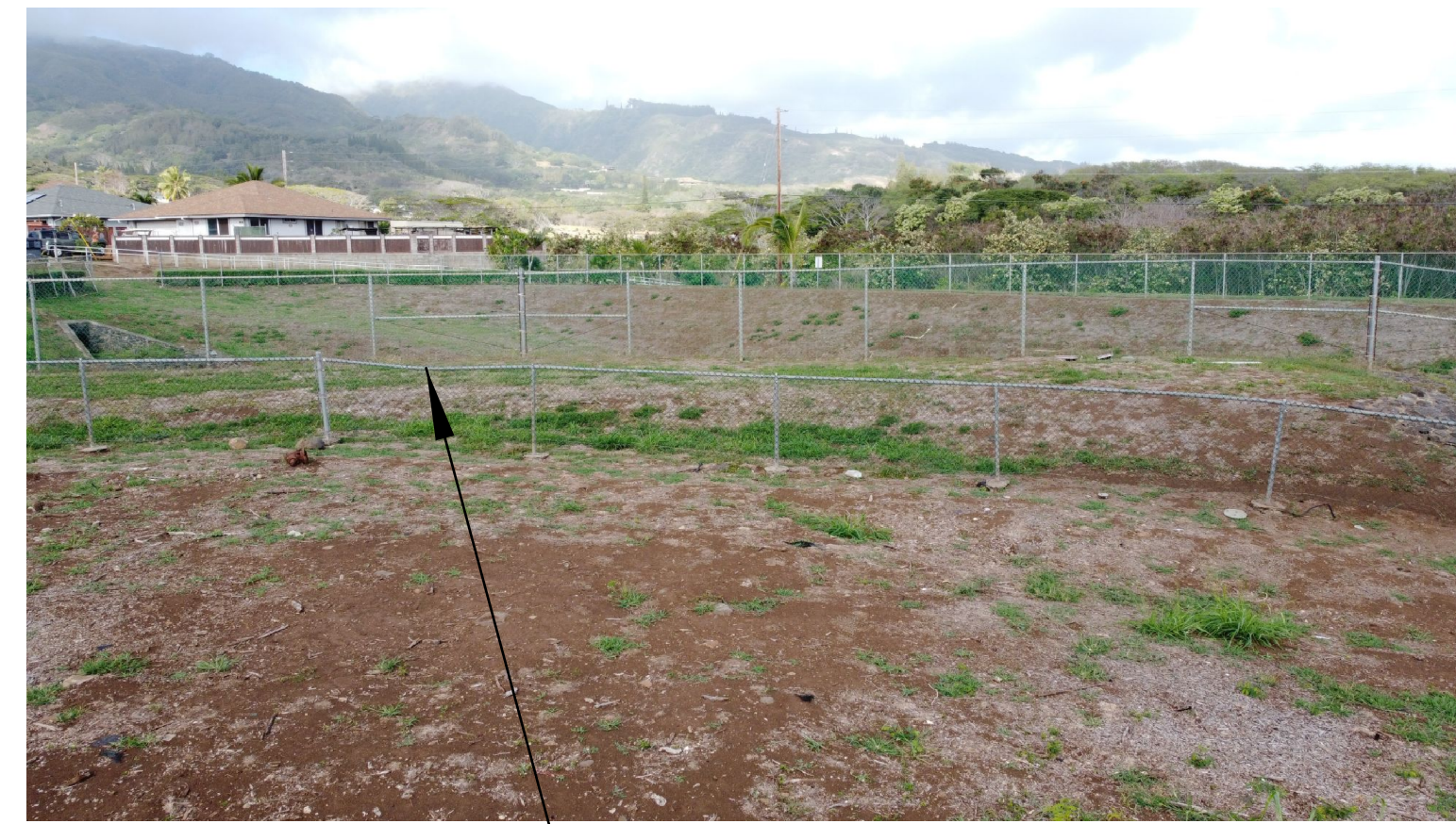
REPLACE 1 PANEL TOP RAIL (APPROXIMATELY 10 LF)