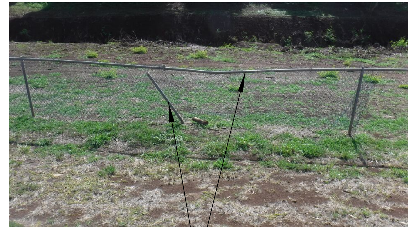
REPLACE 1 POST 4' HIGH AND 1 PANEL TOP RAIL (APPROXIMATELY 10 LF)