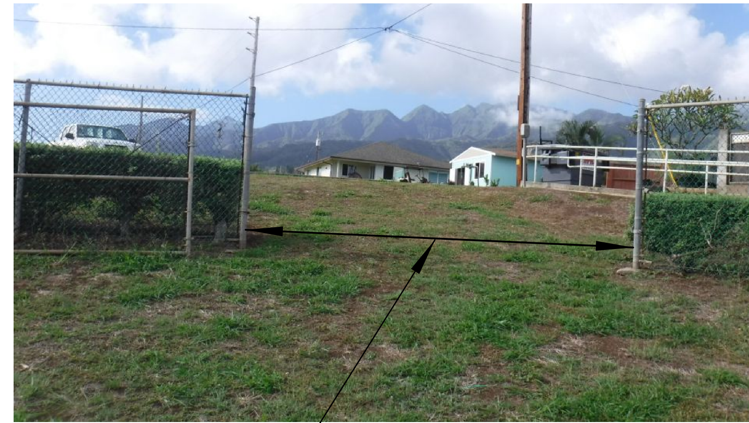
REPLACE 12'x6' GATE