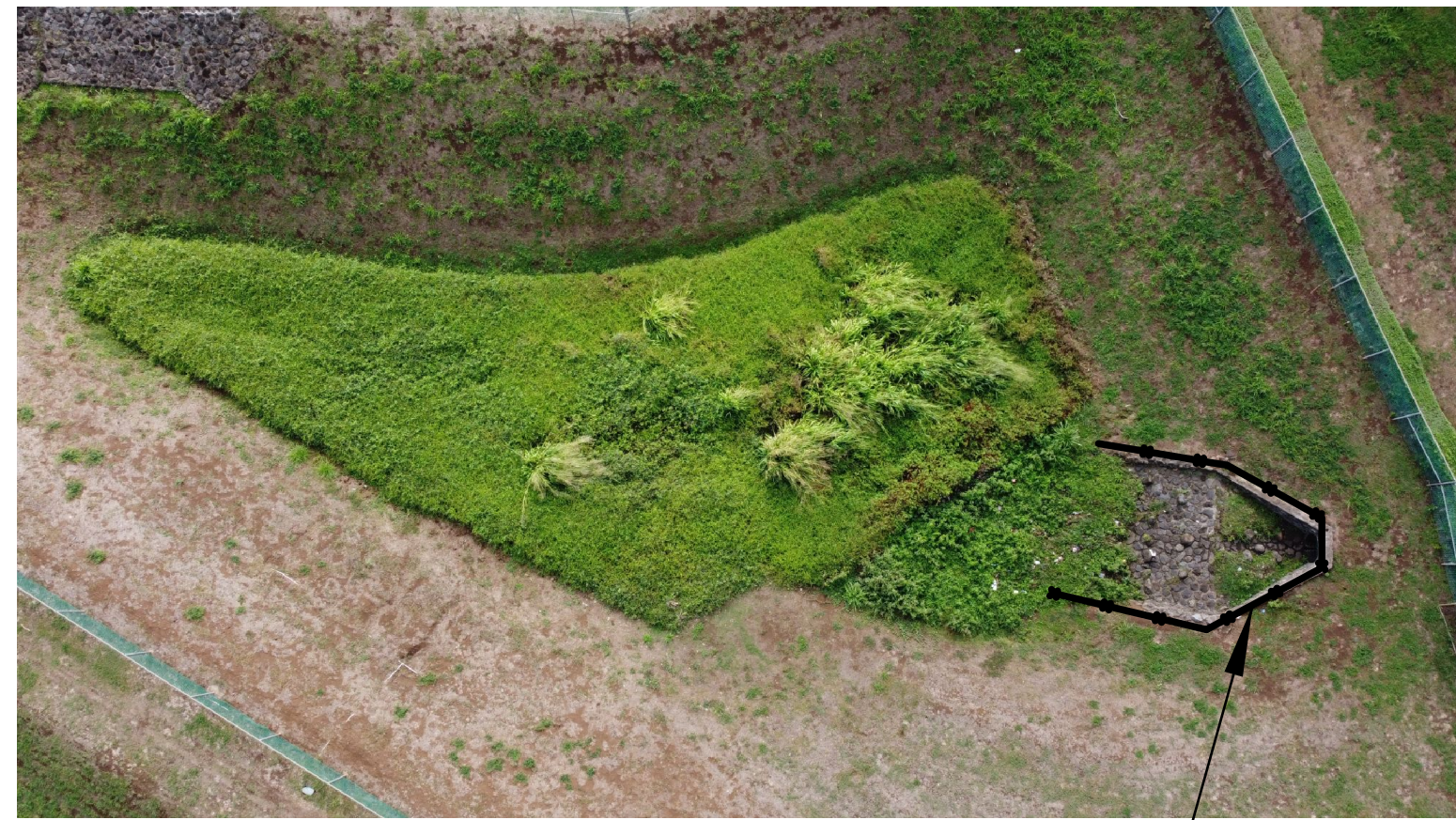
NEW 6' HIGH CHAIN LINK FENCE (APPROXIMATELY 50 LF)