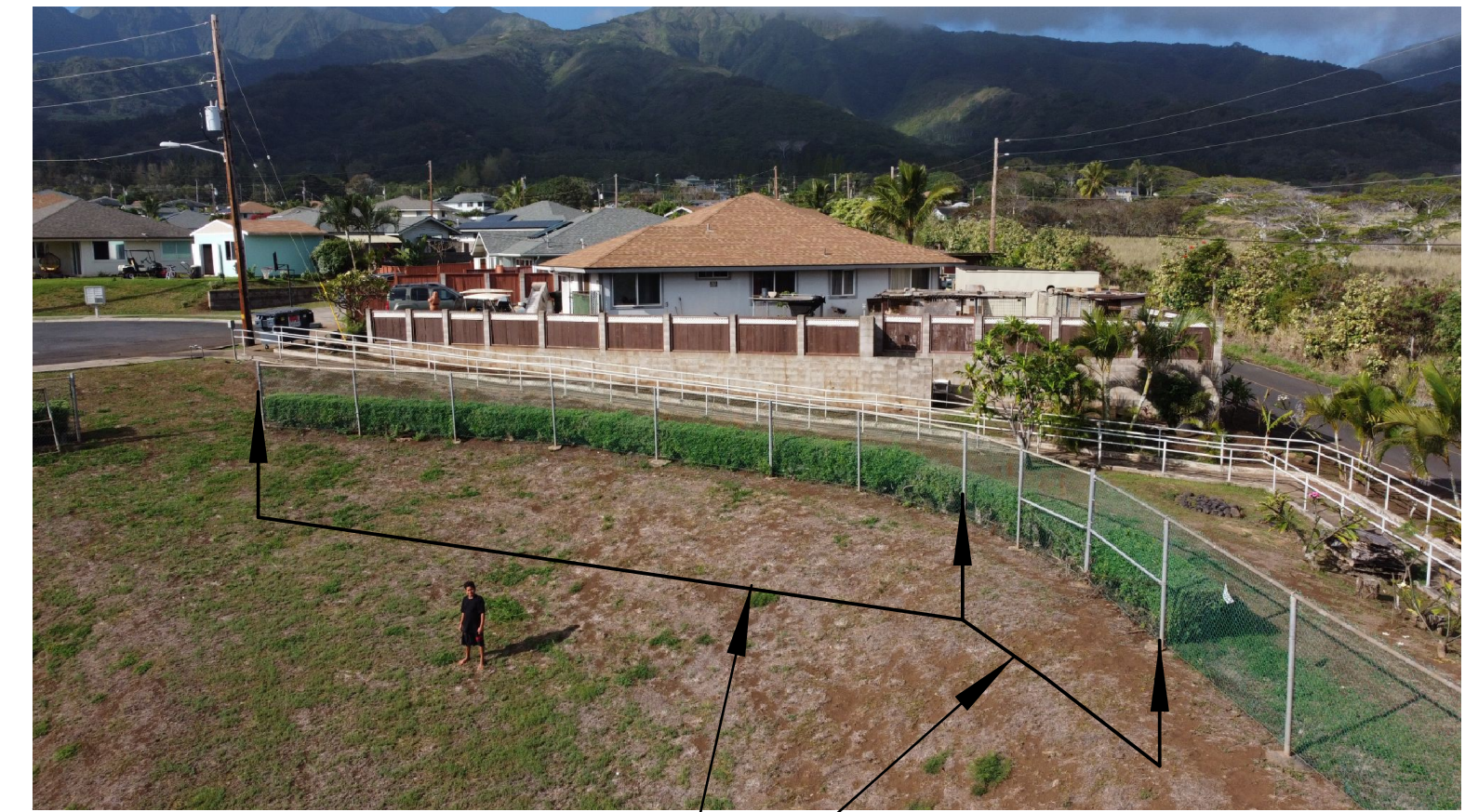
REPLACE 10 PANELS FABRIC (APPROXIMATELY 100 LF)