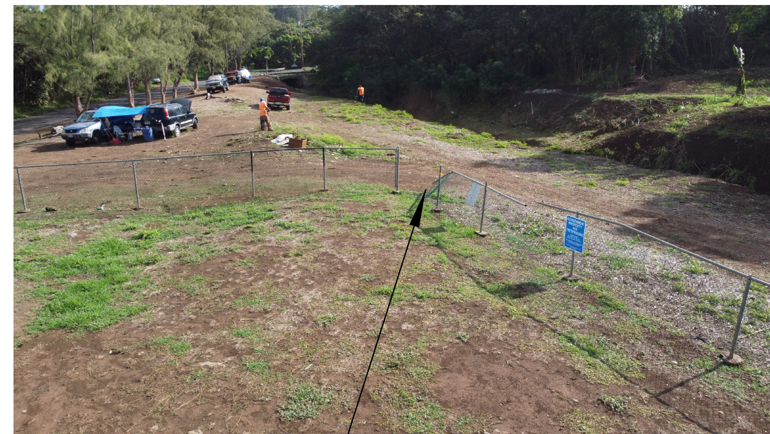
PROVIDE 10'x4' GATE REPLACE 1 POST