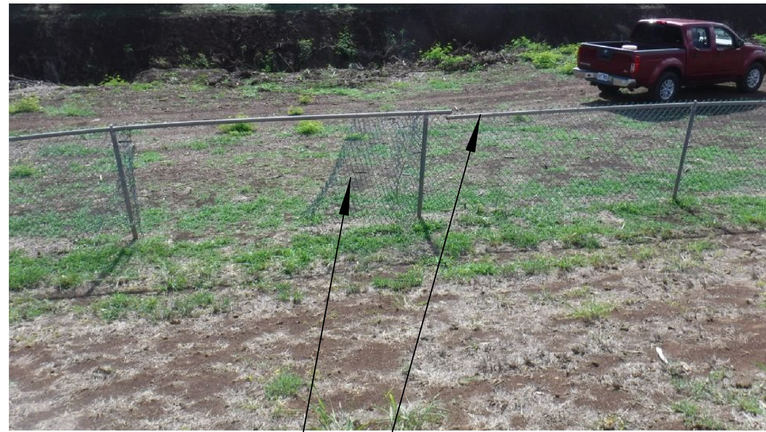
REPLACE 1 PANEL FABRIC (APPROXIMATELY 10 LF)